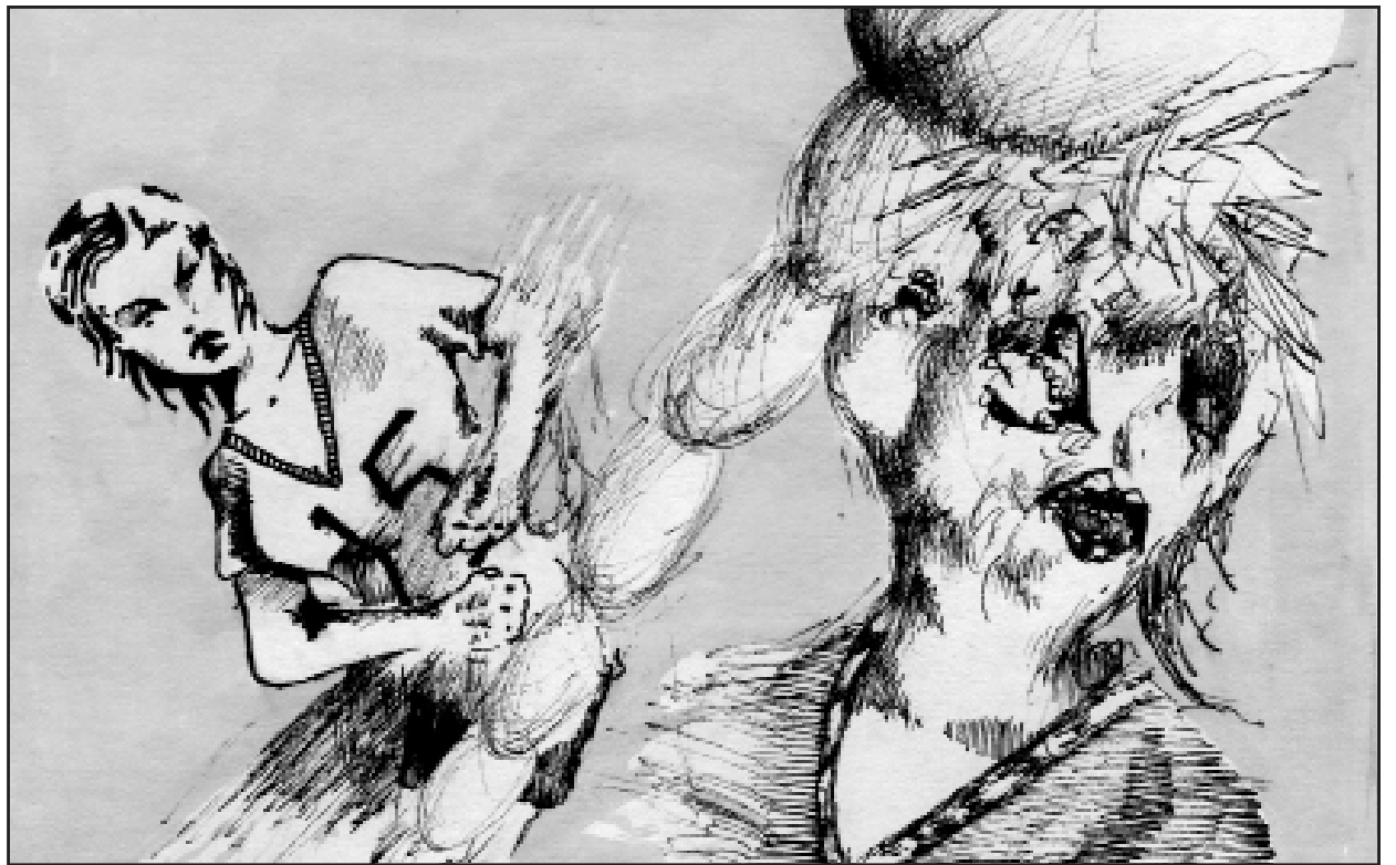
A soccer ball kicked by player #15 soars over the other girl's head, ending with a headshot, which is not a rule violation.